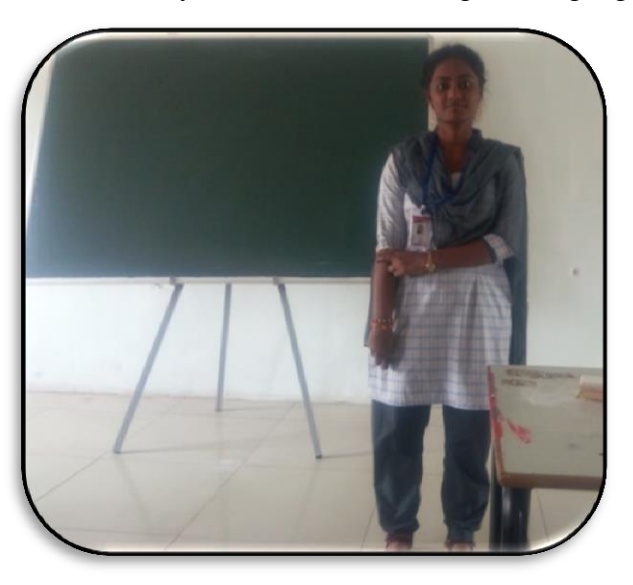
Participant in the JAM Session

In This session they have to speak about any topic for a 1 minute in English and they speak out of any advertisement in English language. It is an individual activity to perform.