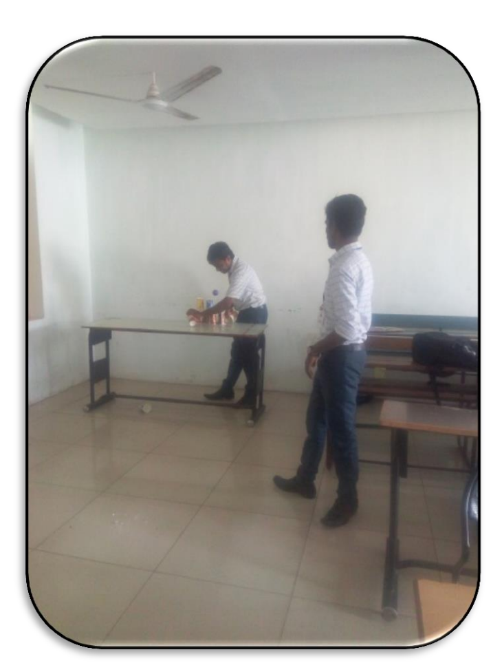
Participants in the Management games