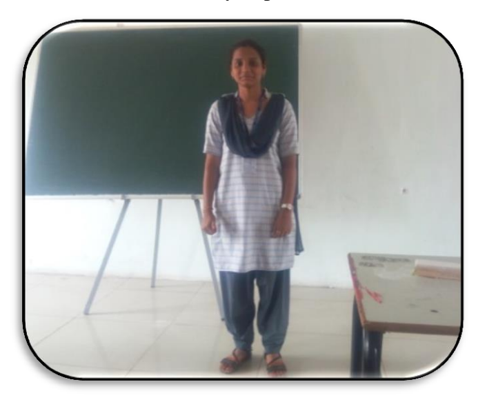
Participant in the JAM Session